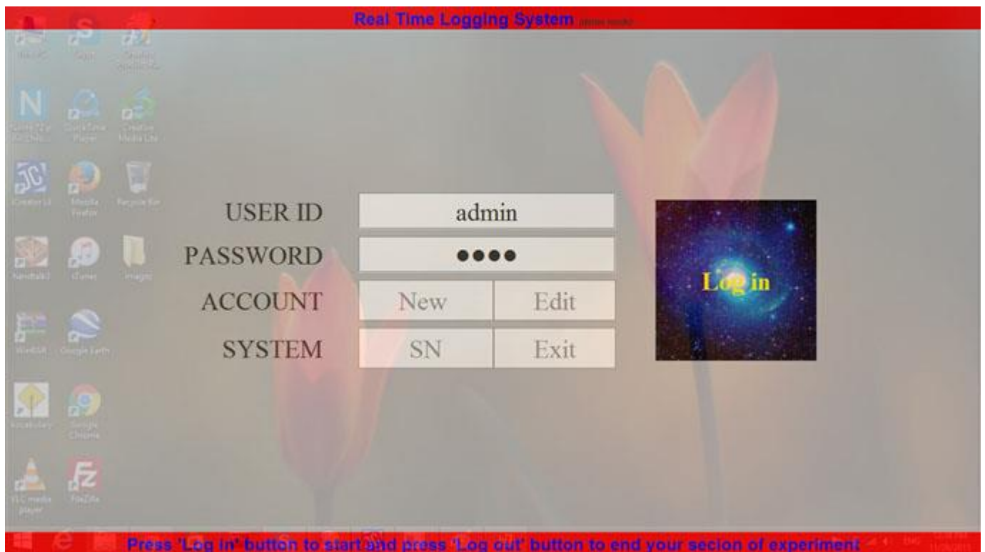
Figure 1. The login interface of Landyne RTLS. It has a semitransparent shield with user ID and password fields, which constantly covers the whole monitor screen. Account and system buttons can only be enabled by an administrator.

Landyne RTLS has two interfaces, a login interface and a logbook interface. The first one constantly covers the whole monitor and the second one can be minimized. Users are required to fill their user ID and password in the login interface, they will log into the logbook interface if the user ID and password are validated. In the logbook interface, user can use the computer to control the equipment at minimize status and to check and fill the info in the normal status. When users log out, the info about users and the usage of the equipment is automatically saved and the login interface is ready the next user.